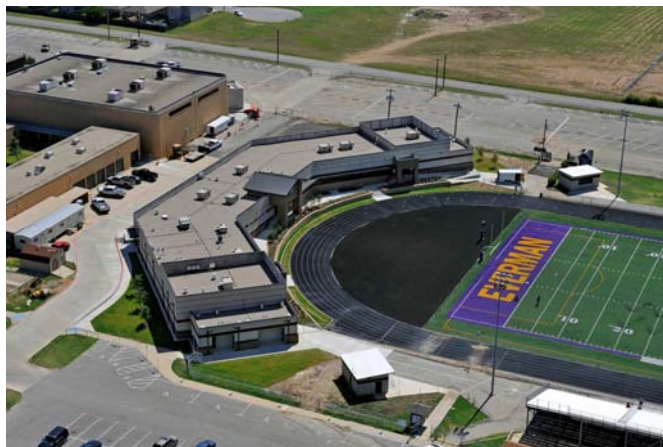
Everman ISD Field House